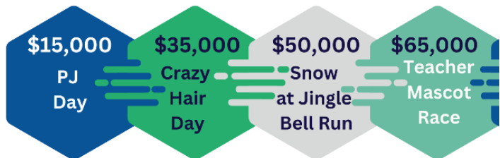
School-Wide Goals & Rewards