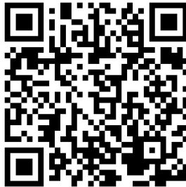
Volunteer Registration QR Code